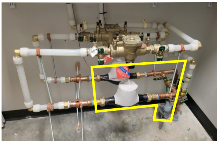
Commercial with Two Meters