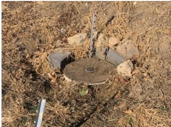
Residential Meter Pit (Meter under lid)