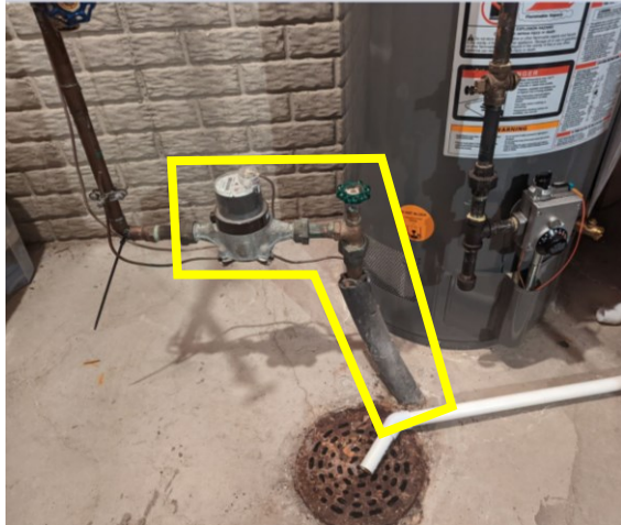
Residential with One Meter