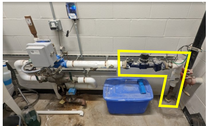
Commercial with One Meter